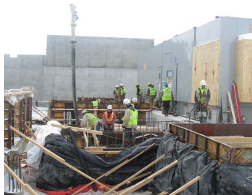
Gas turbine under construction.

The Commercial Operation Date for Phase 1 of HGS has slipped a bit – it is now August 2011. Weather has contributed to this delay, however perhaps the more contributing reason is that Northwestern Energy is way