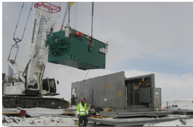
Recent construction activity at the HGS site—generator during mid-lift.

(Phase 2) of the entire 120 MW. As reported to you last month, Southern has identified an estimated bus bar cost of power generated from the full 120 MW HGS facility. A big question mark with one of the components used in making this calculation is that of the interest rate associated with the financing for this facility. Southern is working to identify what the available financing options are and what the approximate interest rate would be.