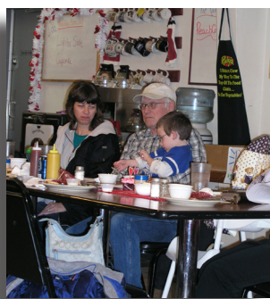
BEC members attend the Board's Town Hall meetings.

The meeting's Talking Points document is posted on the BEC Website under the News tab.